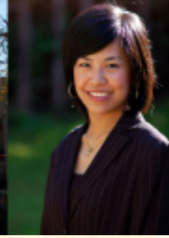
Kansas City, Missouri